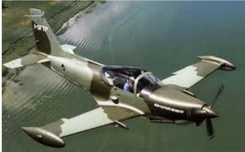
The SIAI Marchetti

All was well so we departed into mild turbulence and made a right 180 to head west. I tried to get Flight Following. ATC was so busy, it took 5 minutes to get a turn to call him. It soon smoothed out. Finally, I could enter Ontario's Class C Airspace. We turned right to El Monte. Then left to KCMA.