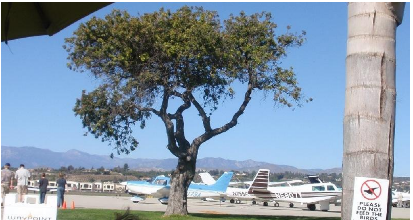
Clean air, other pilots walking to their planes, and my Mooney parked close by, from our table