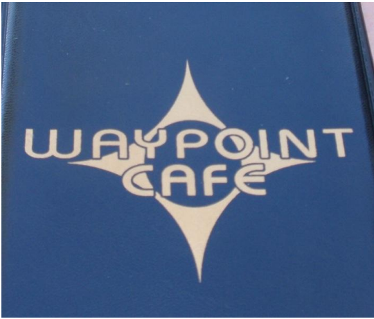
Remember the Waypoint Café at Camarillo's airport.