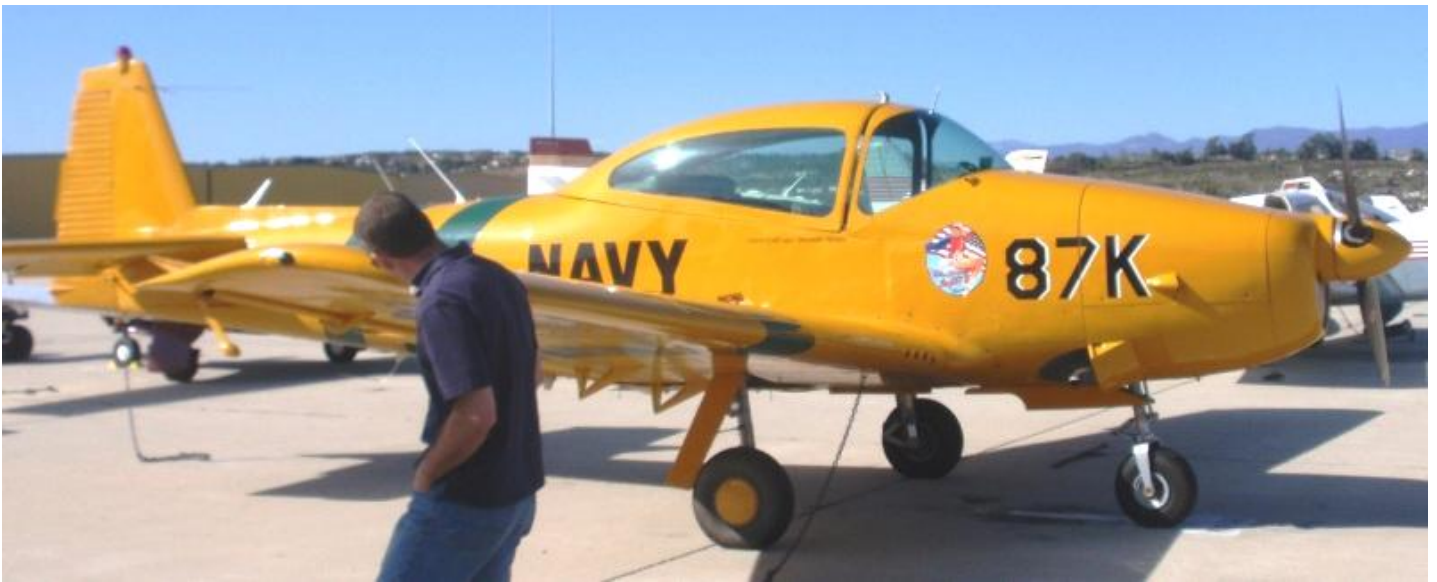
We went out on the ramp after lunch and checked out this distinctive yellow Ryan Navion. With a slide back canopy, there are no doors, you just climb in. It has a 1940s era military look to it. The paint scheme adds to that look. The logo on the cowl is also reminiscent of the 1940s era